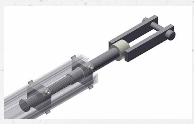
The thread is covered, so it is protected against dirt. Designed for a long service life, it also minimises maintenance.