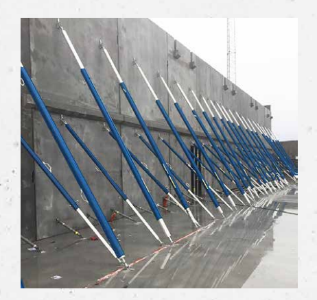
On concrete precastings

DokaRex for precise adjustments on every kind of prefabricated element.