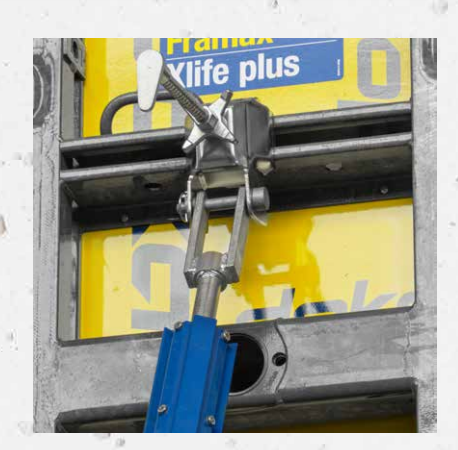
Alignment strut on the formwork (with formwork-adapter pin set)

A simple adapter set enables DokaRex alignment struts to be used with all Framax, Frami and Top 50 wall formwork systems as well: