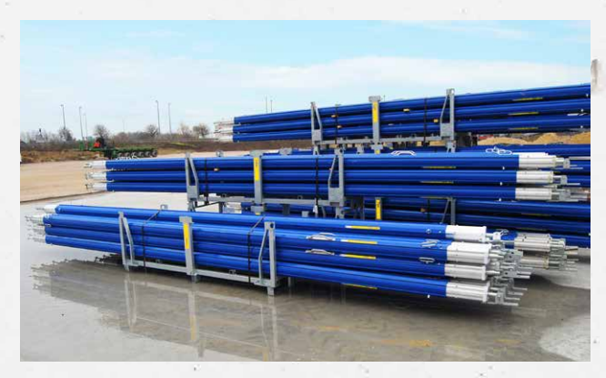
DokaRex is delivered ready for use to your site.