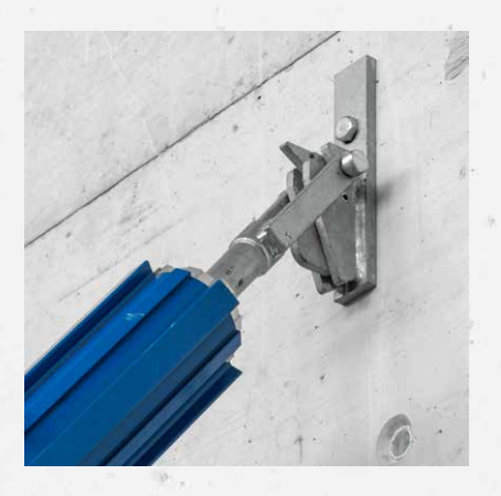
Connection by worker on ground level by means of docking head