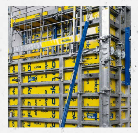
Panel struts on the formwork (with formwork-adapter pin set and panel-strut shoe)