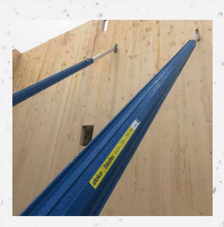
On timber and steel structures